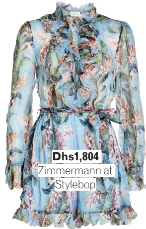
Dhs1,804 Zimmermann at Stylebop

When in Mykonos, it's blue and white all the way. Nicknamed The Windy Isle, make sure you take plenty of sunscreen as it's all-too easy to get burnt without noticing.