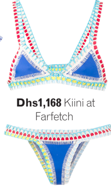
Dhs1,168 Kiini at Farfetch