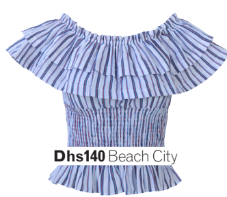
Dhs140 Beach City