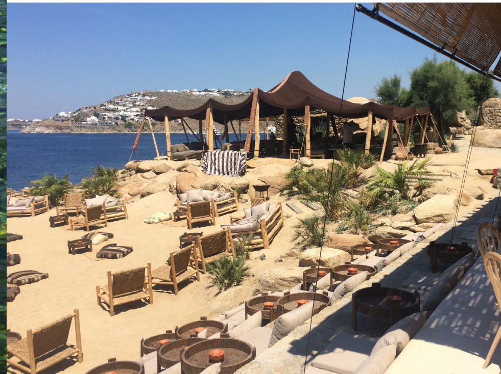
Scorpios is the perfect place to relax with a sundowner

On the sun-drenched southern tip of Mykonos, overlooking uninterrupted views of the Aegean and hugged by the wild wonders of a protected natural reserve, sits Scorpios Beach Club; a dreamy boho slice of paradise with an in-tune-with-nature appeal. Driftwood day beds, wicker lampshades, terraces tiered by weathered stone walls and rugged waiters serving huge platters of mezze and mint mocktails give it a holistic-yet-chic vibe. So whether you fancy dreaming away a lazy afternoon in your private beach cabana, discovering the impeccable modern-Greek menu, or listening to one of Mykonos' top DJs spinning under the Mediterranean sunset, Scorpios will certainly not disappoint. We suggest staying for the party at sundown where a crew of drummers in feathered headdresses play along to soul-jazz, bringing a touch of Burning Man to the Med. With a glass in hand and the sun setting behind you, this is a glorious ticket to appreciating island life at its very best. 🍷