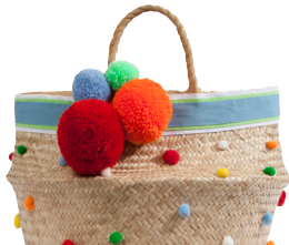
Dhs1,320 Le Nine at Boutique 1